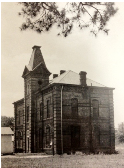
Old jailhouse, Conroe

From Attakapas and Kickapoo Indians to Austin's Second Colony to saw mills and lumber companies, Montgomery County has a rich and variable history. Early settlements include Danville and the town of Montgomery, which became the first county seat. Other early towns include Old Waverly, New Caney, Esperanza, Willis, and Magnolia. The city of Conroe was established about 1886 and became a crossroads for the railroad in the county. Conroe became the county seat in 1889. Today Montgomery County is home to 455,746 residents.